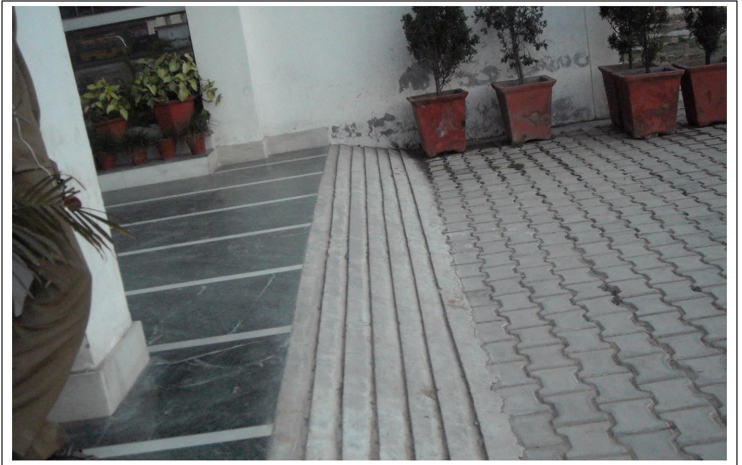
Facility For Disable